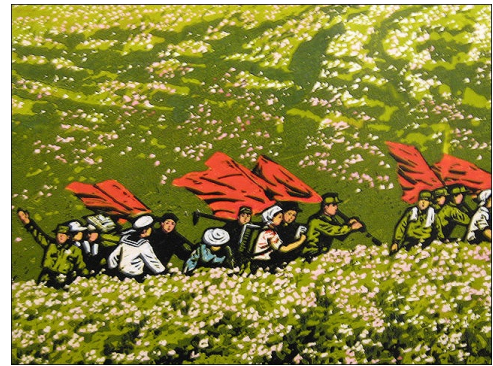
1999: Potato flower fragrance of Tachongden Province in the North of the country is a major source of North Korea's potato crop Soldiers and sailors who have completed their military service have volunteered to come and help work in the field.