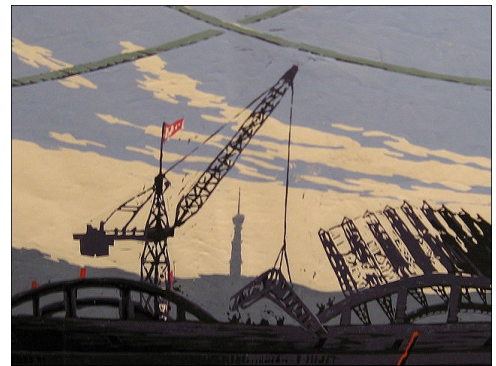
May Day Stadium construction 1988.