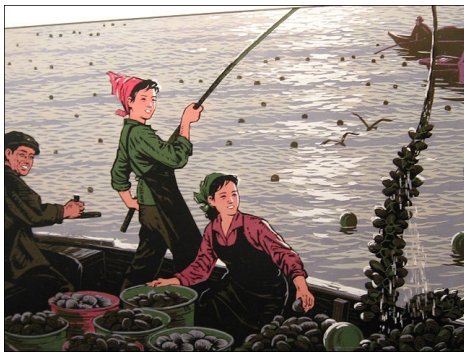
Shallow sea harvester 1988: Lifting and sorting shell fish which are used widely as part of the Korean's food diet, these women who harvest them are helping to feed the nation.