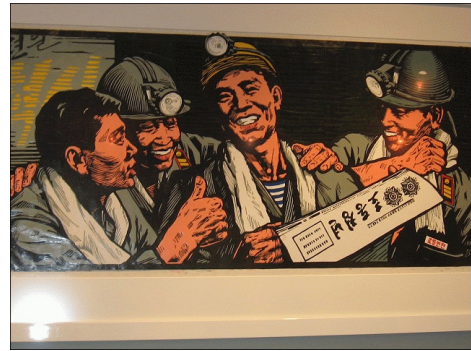
Happiness of the Miners: Young miners enthusiastically read newspaper article describing their success in exceeding production quotas.