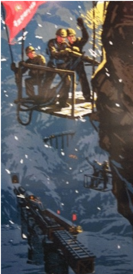
Building a railway thru mountains: Trough the 1980s workers from all over North Korea came to help build a railroad through the country's northern mountains. Suspended on a sheer cliff high above a raging river and buffeted by wind and snow the figures pursue their work.