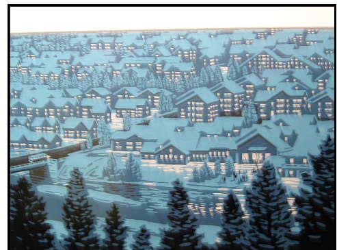
Constellation of Lake Samji Village: Power from recently built hydro electric station on Lake Samji lights up the windows of a nearby village which presents as a pattern of glowing stars.