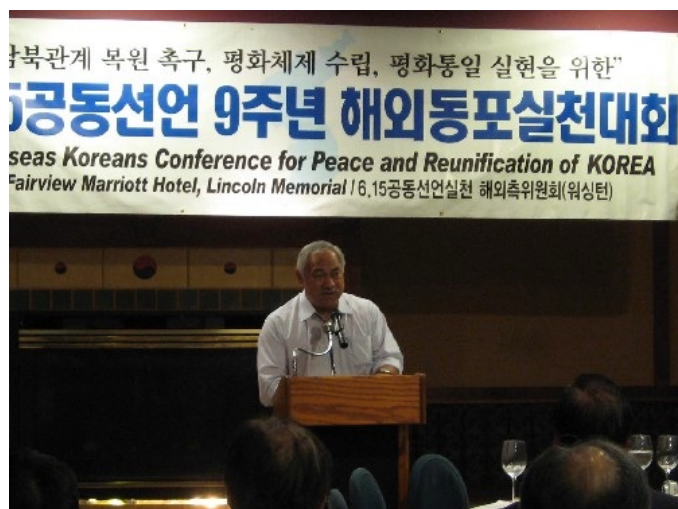
U.S. Congressman Eni Faleomavaega of American Samoa

On Friday evening there had been a short set of talks at the dinner held at a Korean restaurant in Tysons Corner, Virginia. U.S. Congressman Eni Faleomavaega of American Samoa, who is the Chairman of the Foreign Affairs Committee on Asia, the Pacific and the Global Environment, gave a short presentation about his support for the Sunshine Policy and his respect for the work done by former South Korean President Kim Dae Jung.